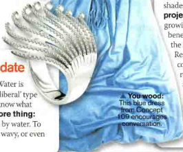
▲ You wood: This blue dress from Concept 109 encourages conversation.

► Wave hello: The waves on this ring from Cupid Jewel could help you score.